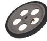
12" Measuring Wheel Item # DT12