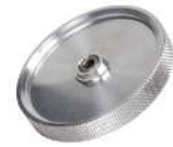
12" Measuring Wheel Item # LMA-3