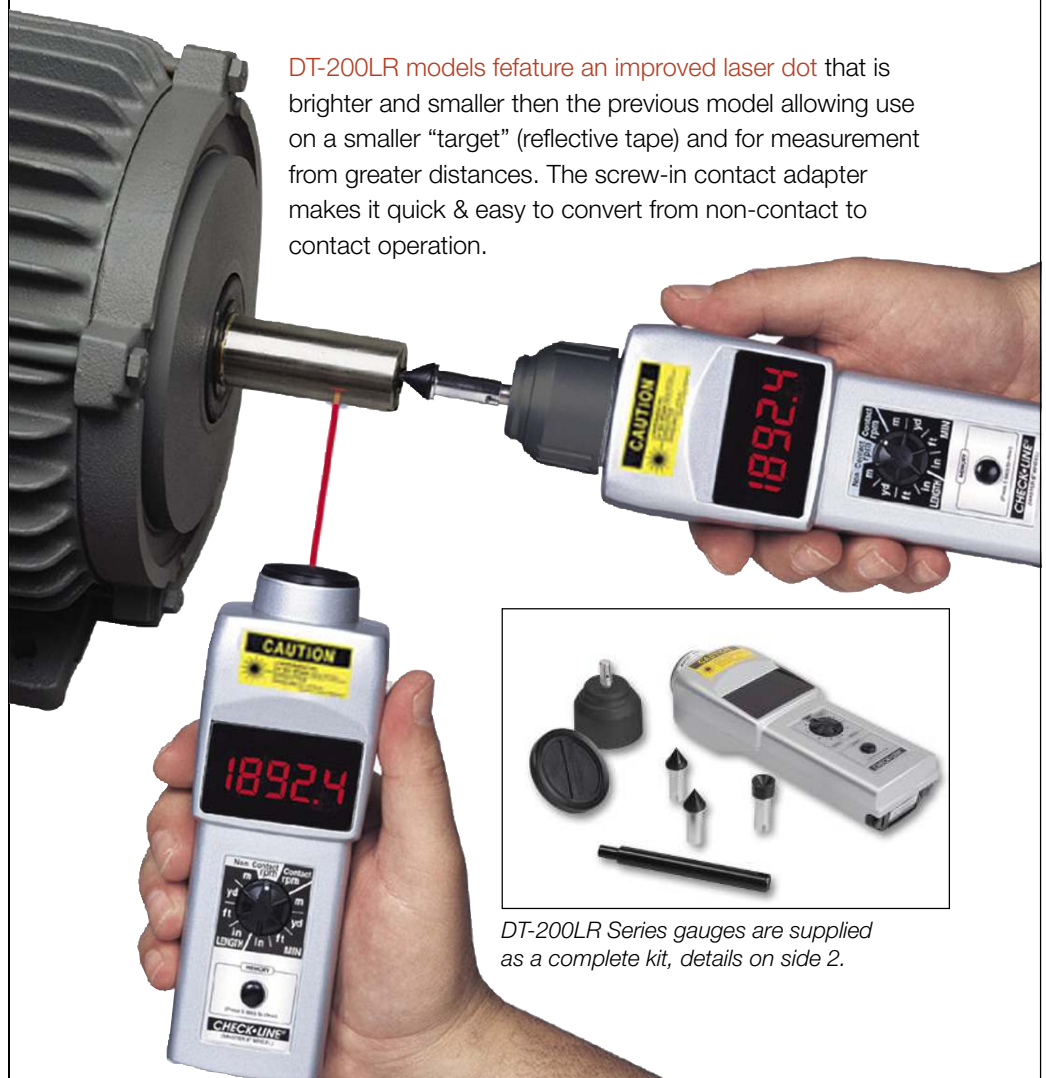
DT-200LR Series gauges are supplied as a complete kit, details on side 2.