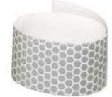
Reflective Tape Item # 205T